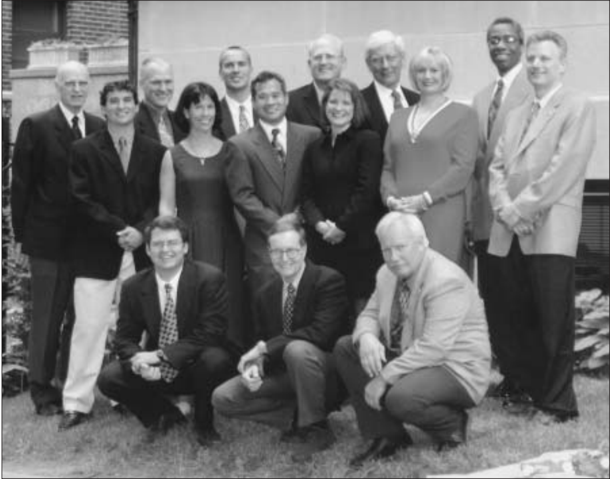
2003 EM Faculty