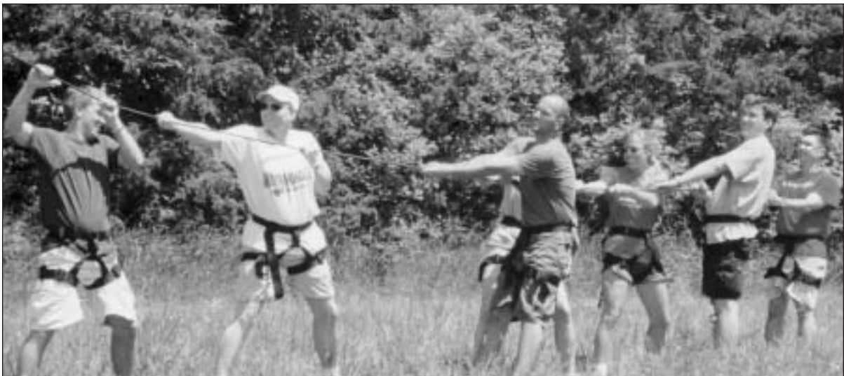
Class of 2006