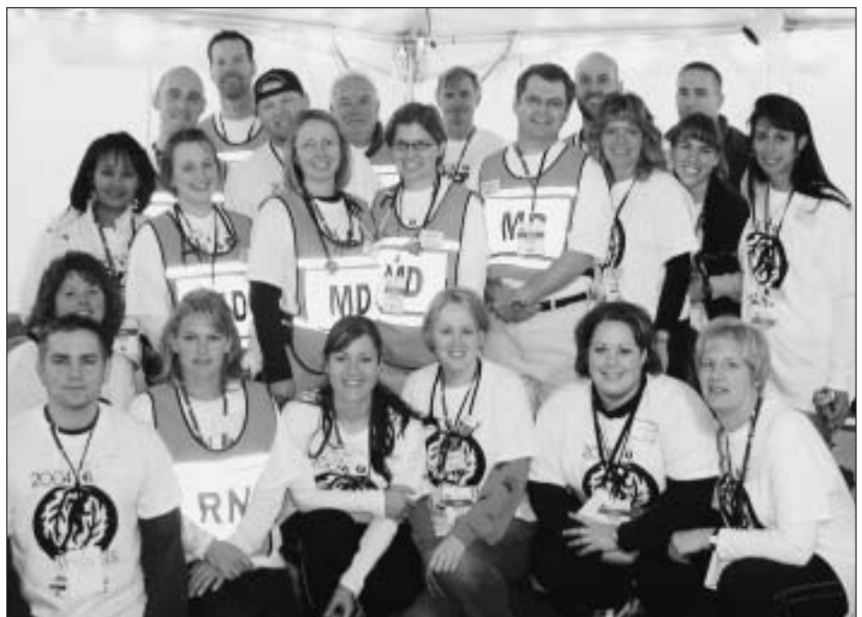
Medical Tent, Twin Cities Marathon 2004.