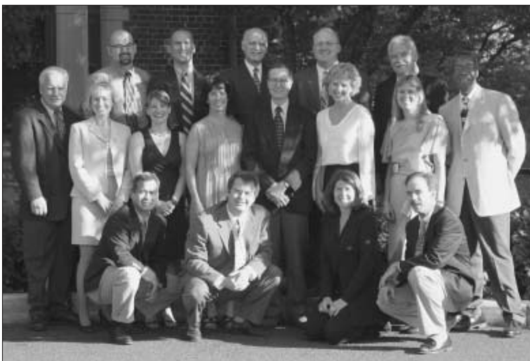
2004 EM Faculty