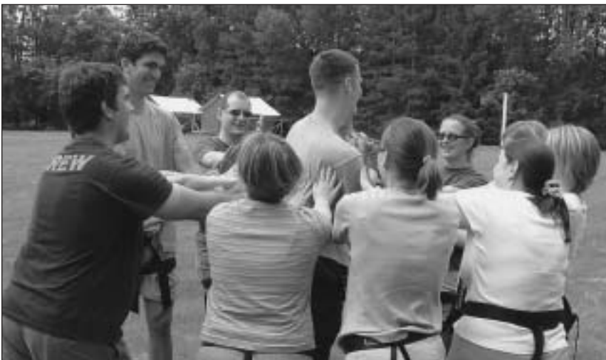
Class of 2007